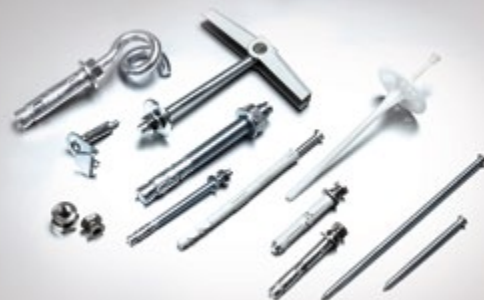
DOWELS AND ANCHORS

Our technicians are able to provide customized solutions to meet specific requirements.