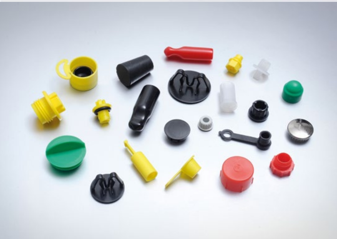
PLUGS AND PLASTIC INSERTS