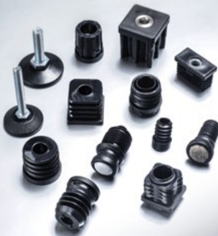
INSERTS, FEET AND BUMPERS