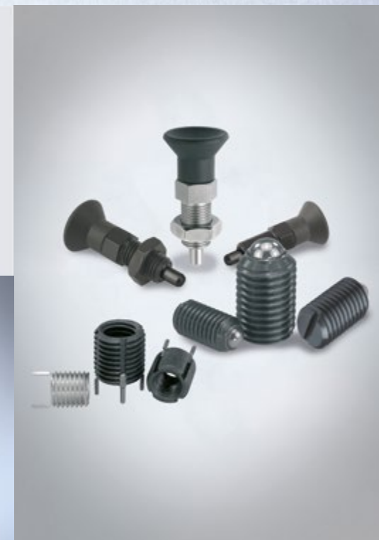
SPRING PLUNGERS INDEXING PLUNGERS BALL LOCK PINS