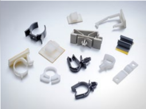
WIRE PIPE CLIPS