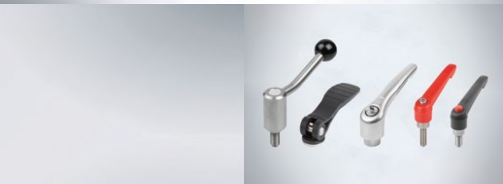
CLAMPING LEVERS TENSION LEVERS CAM LEVERS