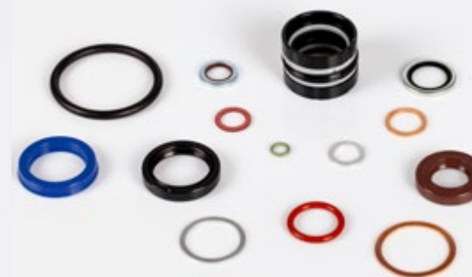
O-RING BONDED SEALS OIL SEALS