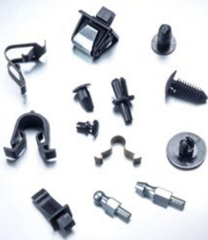
STRIKES AND LATCHES, RIVETS, CLIPS AND SCREW GROMMENTS