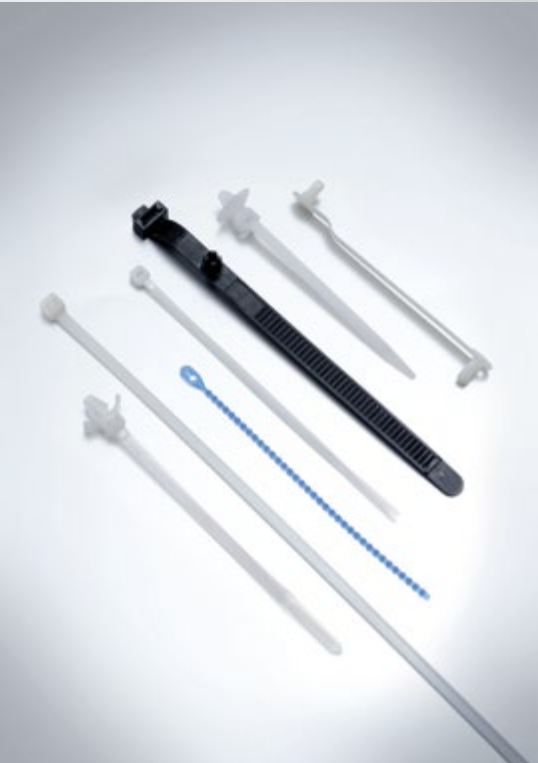
CABLE TIETS, TWIST LOCKS, SUPPORTS FOR WIRING