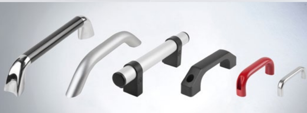
PULL HANDLES TUBULAR HANDLES RECESSED HANDLES