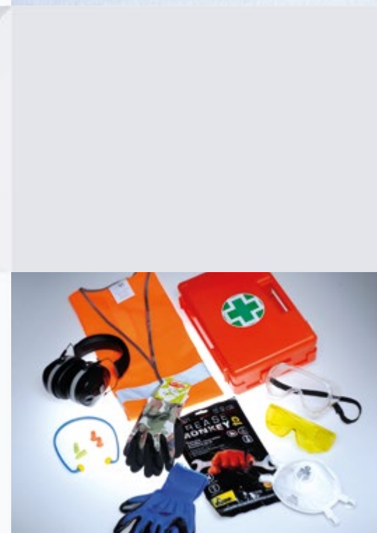
PERSONAL PROTECTIVE EQUIPMENT