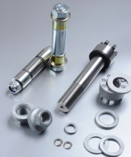
SAFETY SOLUTIONS FOR FASTENING SYSTEMS WASHERS AND NUTS