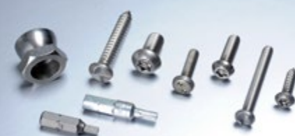
CAPTIVE SCREWS ANTI-TAMPER SCREWS